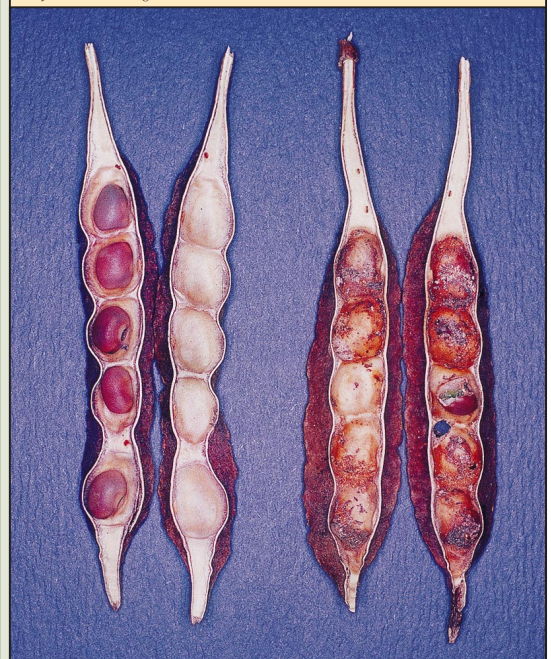
Opened sesbania seed pods: undamaged seeds (left) and Rhysomatus damage (right)