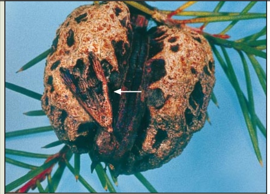
Adult hakea seed-moth on a hakea fruit

Because the larvae destroy the seeds in mature fruits of Hakea sericea they reduce the quantity of seeds available for regeneration after fires. Field observations indicate that the seed-moth can destroy up to 80% of the accumulated seeds at some sites.